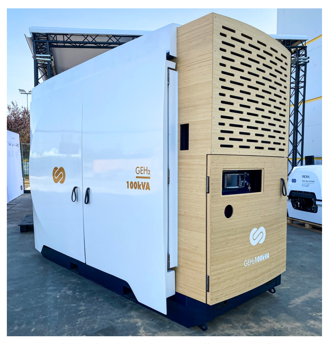
The GEH2 ready to be turned on