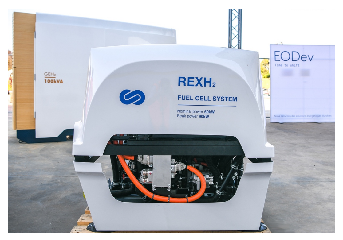
The REXH2 in the foreground, with the GEH2 in the background