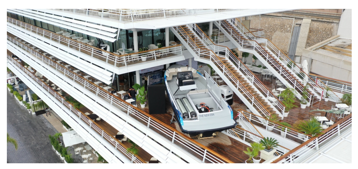
The New Era prototype from Hynova Yachts on the decks of Yacht Club de Monaco, where the REXH2 and its Hexagon hydrogen tanks are visible