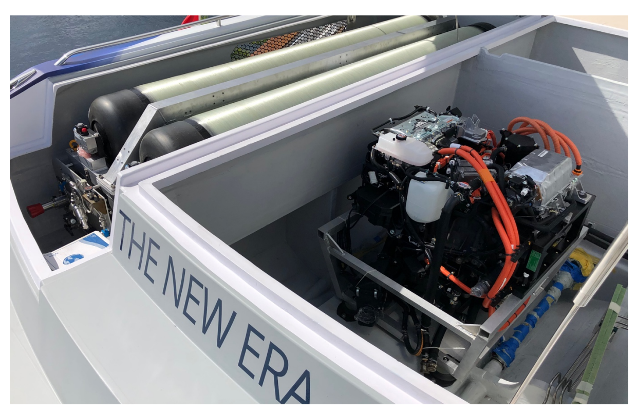
The New Era prototype of Hynova Yachts with its REXH2 and Hexagon hydrogen tanks