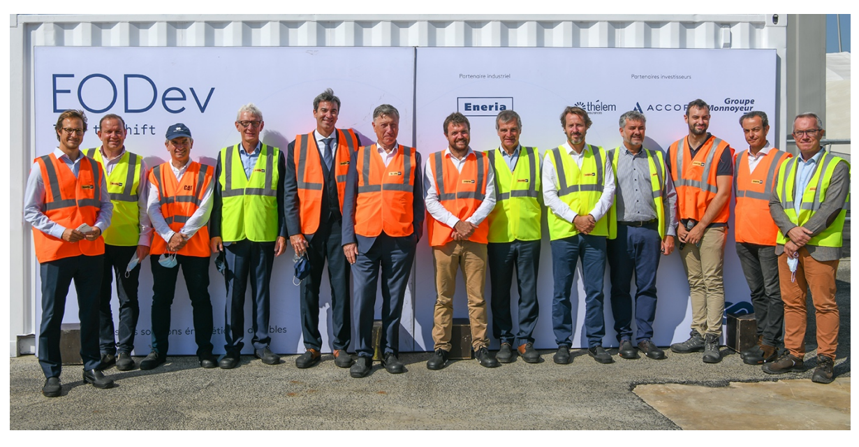
Directoes, partners and shareholders gather for a family portrait at Eneria's site in Montlhéry in september 2020