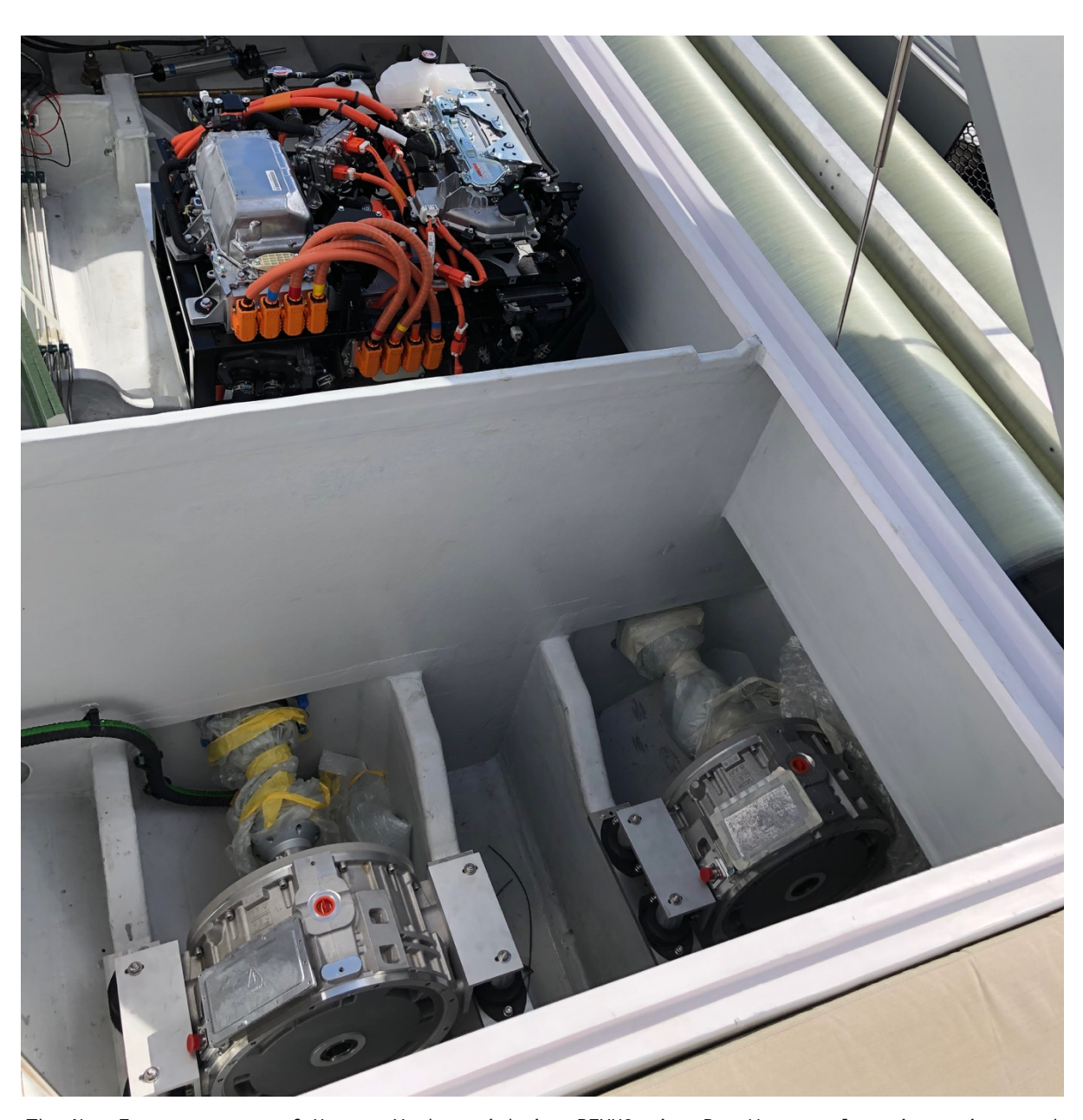
The New Era prototype of Hynova Yachts with its REXH2, its BorgWarner electric engines and Hexagon hydrogen tanks